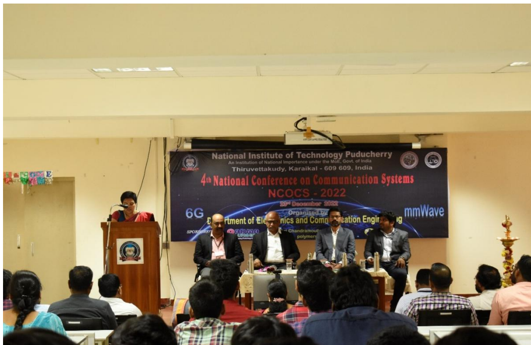
4 th National Conference on Communication Systems – NCOCS 2022 held at National Institute of Technology Puducherry on 23.12.2022